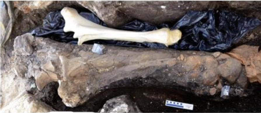
A cast of a lower leg bone of a modern-day African elephant is dwarfed by the fossilized lower leg of Ernie, the enormous Tennessee mastodon.